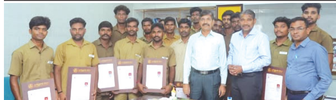
On June 17, 2026, at the Secretariat, the Honorable Minister for Social Justice, Thiru. Vanni Arasu, presented training certificates to and commended 16 tribal youths. These individuals had completed heavy motor vehicle training under the "Tholkudi Thoduvanam" scheme, obtained their driving licenses and public service badges, and secured contract-based employment with State Transport Corporations.