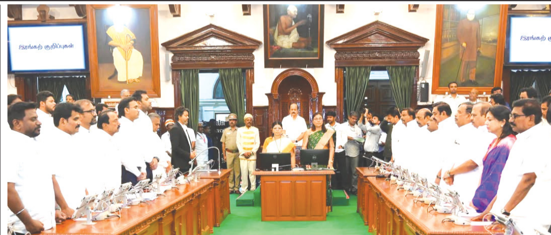
In the Tamil Nadu Legislative Assembly, condolence messages were recorded regarding the demise of former members of the House, and condolence resolutions were passed—followed by the observance of a silent tribute—on the passing of veteran Communist Party of India leader Comrade Thiru Nallakannu, former Assembly Secretary Thiru C.K. Ramasamy, renowned film producers Thiru R.B. Choudary and Thiru K. Rajan, and acclaimed film director Thiru Bharathiraja.

your endeavors, and excellence in public life," said Chief Minister Vijay. When the Tamil Nadu Assembly elections saw the emergence of the largest party in the state and the formation of a government, the Congress party was the first to extend its support. It is noteworthy that only later did the Communists, VVIP and IUML extend their support.