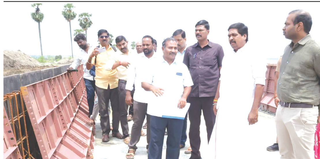
The Honorable Minister for Housing and Urban Development, Thiru P. Rajkumar, inspected the Water Resources Department projects and the Cuddalore Port expansion works.