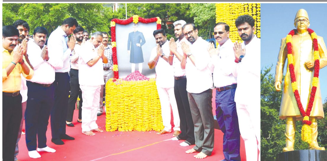
On the occasion of the 96th birth anniversary of V.P. Singh, a champion of social justice, Honorable Ministers paid their respects by garlanding his statue and showering it with flowers.

out that too," he said. He continued, "The essence of this white paper is that in the past, people were in trouble, the industrial sector was in trouble, the power sector was in trouble. It is not known who benefited. That is what we are looking for from all sides. Everything is shown as expenditure. But no infrastructure has been improved according to the expenditure incurred. Not only transformers, there has been irregularities in the procurement of electrical conductors as well. There have been irregularities in the procurement of electrical conductors at 9 locations. "If the government had not been formed under the leadership of Chief Minister Vijay, the Electricity Board would have been privatized. We will engage in the work required to improve the Electricity Board," he said.