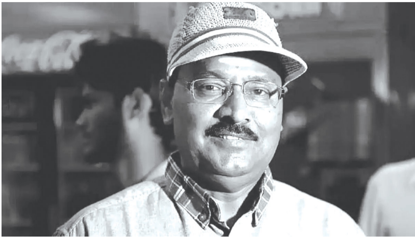
Bhagyaraj is the unrivaled screenwriter of Indian cinema" EPS tribute

Chennai Famous actor and director K. Bhagyaraj passed away due to a heart attack. He was 73. The Tamil film industry is in mourning due to the loss of Bhagyaraj, who attracted a lot of attention in Tamil cinema with his unique style of screenwriting and entertained the audience with his humorous acting skills. It has caused great sadness. Due to his interest in the cinema industry, he worked as an assistant director to directors G. Ramakrishnan and Bharathiraja. He began his film career in 1977. He worked as an assistant director with Bharathiraja in films including '16 Vayathinile' and 'Kezhakaye Pogum Rail'. He co-wrote the stories for the films Kezhakaye Pogum Rail and Tik Tik Tik with Bharathiraja. He wrote the dialogues for the film Sigappu Rojakkal and also acted in supporting roles. He made his directorial debut with the film Swar Ela Chithiragal.