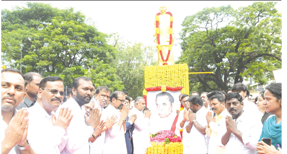
On the occasion of the 121st birth anniversary of 'Silambuchelvar' Ma.Po. Sivagnanam, Honorable Ministers paid their respects by garlanding his statue and showering it with flowers.

bitterness. When the opportunity arises, I will speak openly about it. Therefore, I am not a person who criticizes anyone, is embarrassed, or speaks. When I met national leader Mallikarjun Kharge on Sunday last week, I made a request to him to relieve me of the post of state leader. There is no pressure on me to resign. I would be happier not being in office than being in office. The next state president will be decided by the All India Presidency. He said