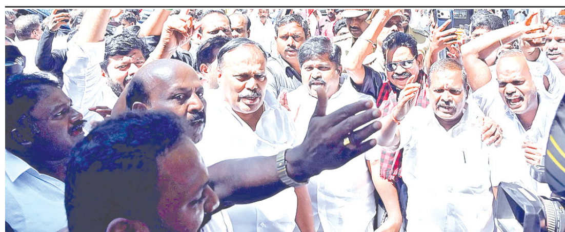
DMK student protest defies ban, demanding removal of Teva Minister Sarathkumar: Former ministers arrested