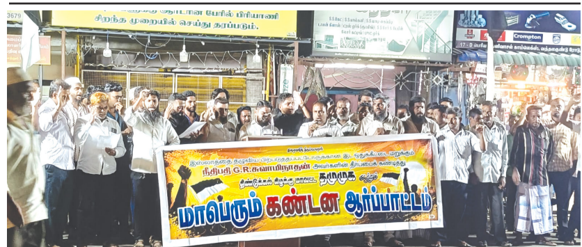
A massive protest demonstration was held by the Dindigul East District unit of TMMK to condemn the verdict delivered by Justice G.R. Swaminathan, which denied reservation benefits to backward-class individuals who have embraced Islam.