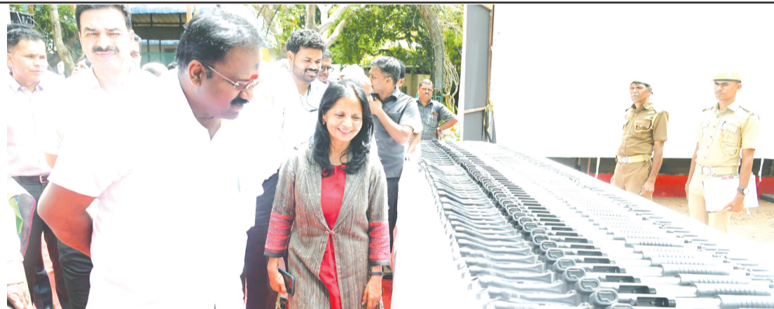
The Honorable Minister for Forests, Thiru R.V. Ranjithkumar, inaugurated the use of 250 modern weapons procured under the Tamil Nadu Forest Force Modernization Scheme today and flagged off new security patrol vehicles for frontline forest staff.

uty General Secretary K.P. Munusamy told reporters, "They are leaving the party after enjoying all the comforts and conveniences of office. "What do we care if the traitors go where they have faced many cases? They have betrayed us at a time when they should have supported and held the party in defeat," he said. Women's wing leader P. Valaramathi says, "The AIADMK has survived many trials. As traitors are leaving, the party is becoming pure." "The new executives have started working with enthusiasm," he said. The meeting was attended by party chairman Tamil Magan Hussain and treasurer Dindigul Srinivasan.